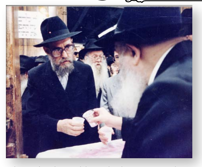
Chinuch, the Rebbe asked me to work as his secretary.

"Your father is a baal sod (one who can keep things confidential)," and the Rebbe added with a smile, "and certainly you too will be a baal sod." I was very happy about this incredible privilege, and began to work with the Rebbe.