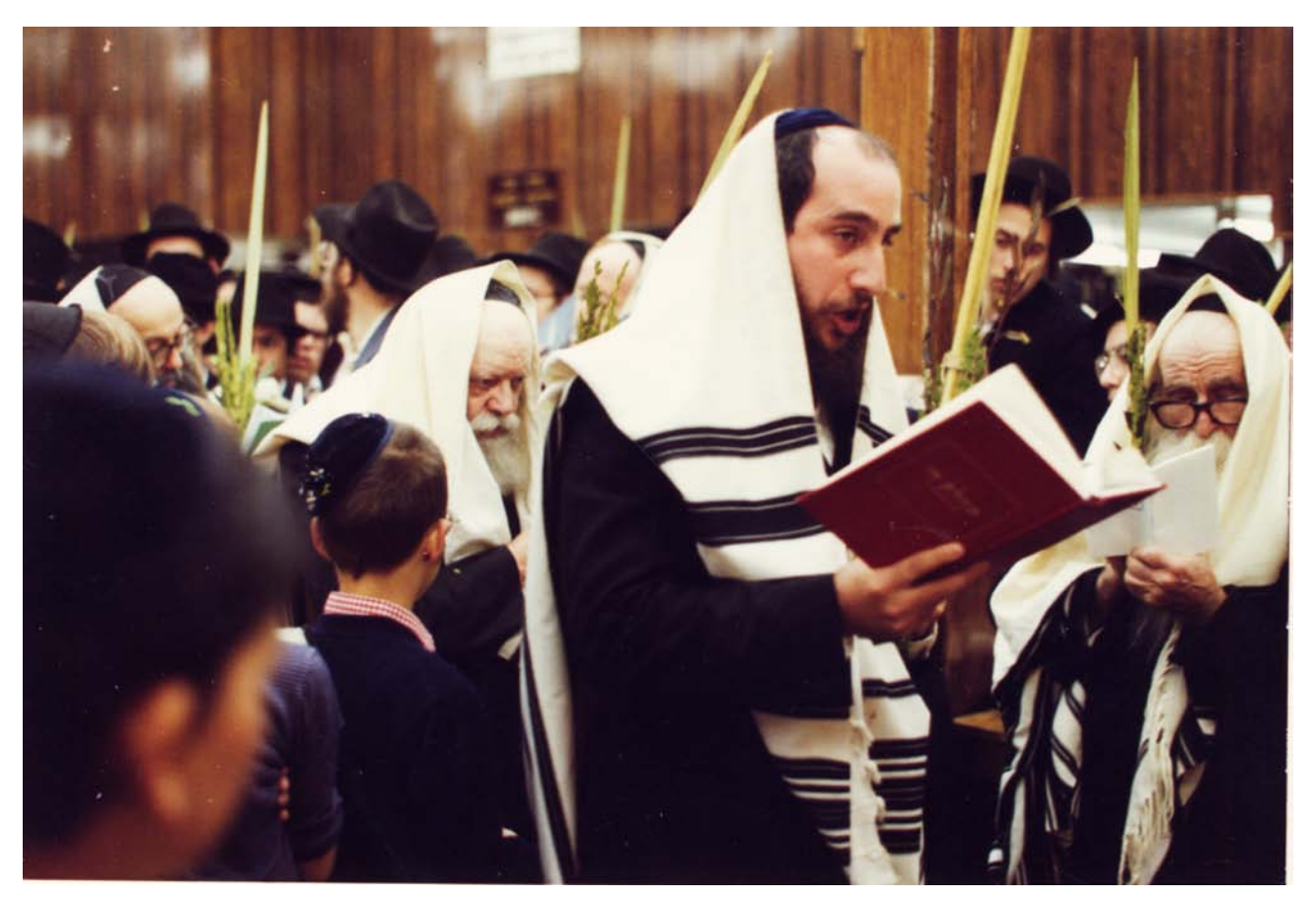
אבי הכלה זכה להיות בין ה'בעלי תפילה' במניינים של הרבי בשבתות ובימים טובים בתמונה: צועד עם ד' מינים באמירת 'הושענות' בחול המועד סוכות, בהקפה עם הרבי